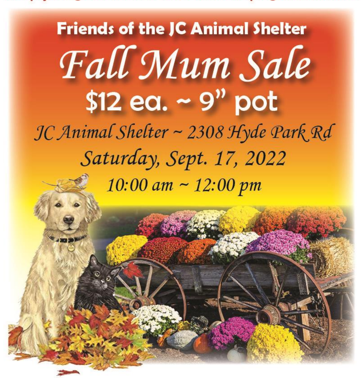
Locally Grown by Longfellow's Garden Center!